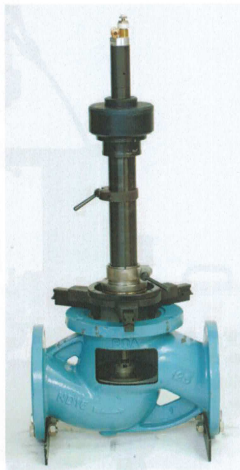
TSV-150 with jaw chuck

The use of an eccentric neutralizes the influence of different cutting-speeds. An even (flat) surface is produced.